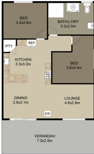
Cottage 62 Square Meters