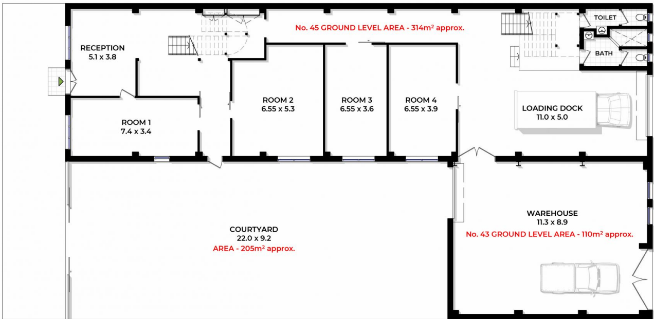
GROUND LEVEL FLOOR PLAN 43 & 45 GROUND LEVEL TOTAL AREA - 424m 2 approx.

No. 43 TOTAL AREA - 220m 2 approx. No. 45 TOTAL AREA - 628m 2 approx. TOTAL SITE AREA - 695m 2 approx.